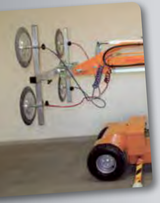
The vacuum system is separated into two vacuum circuits for highest security. Showing vacuum circuits with blue and red vacuum hoses

For high security the stabilizers of the lift are equipped with mandrels to fasten on stable ground for better stability.