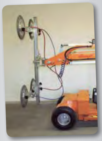
The yoke has movements in all directions